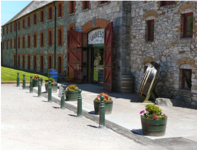
JAMESON WINERY MAIN ENTRANCE

THE JAMESON 'IRISH WHISKY' WINERY , was next on the trip offering beautiful grounds and displays. The Winery was established by Mr John Jameson in 1780 and now offers visitors of old and new facilities with beautiful wine tasting and a gift store.