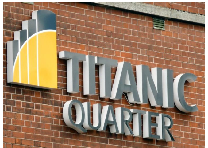
I MUST TAKE A GUIDED TOUR HERE SOME DAY!!

This insert depicts the Crane Driver's perilous Operator's Cab, reached by a very narrow staircase enclosed in the yellow housing, one very scary job site!!