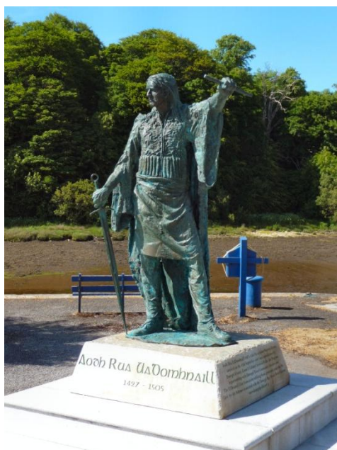
STATUE AT THE TOWN END OF THE DONEGAL INLET