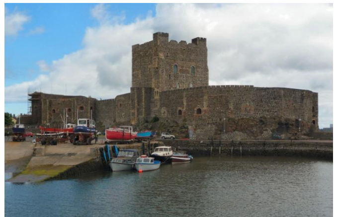
CARRICKFERGUS CASTLE, VERY NEAR MY AUNTIES HOME