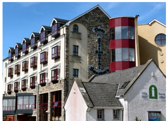
DONEGAL TOWN, OLD AND NEW