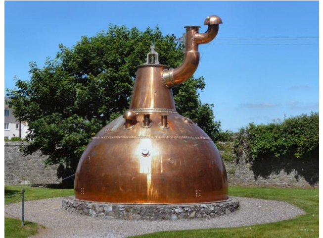
A HUGE VAT!!