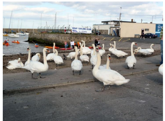
THE LOCALS AFTER AN EVENING FEED!