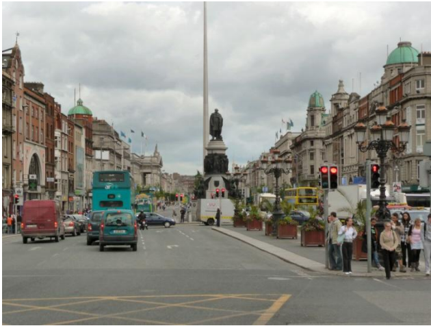
OLD AND NEW BLEND TOGETHER WELL

DUBLIN , I so wanted to spend some time exploring Dublin, Wicklow etc., work commitments, time constraints, whatever, forced a quick look and a fast trip back to Northern Ireland. Some good and acceptable roads, the crazy part was paying to use a Toll Road that one assumed went further than a few kilometres only!! The rest of the Toll Road was still under construction, of course the Toll Booth Attendant failed to mention this as he gleefully took the toll money.