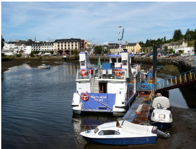
DONEGAL INLET WITH THE TOWN IN THE BACKGROUND

DONEGAL , a 'so peaceful' coastal village, offered a beautiful Ferry Trip along the Inlet, the Potato Famine and perilous embarkation travels to the Americas were highlighted by the guide. Some derelict buildings and a small statue are clearly visible in remembrance of extremely sad times.