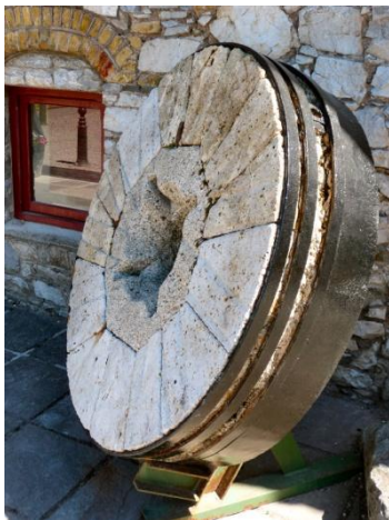
HUGE STOPPER, WHATEVER TURNED IT?