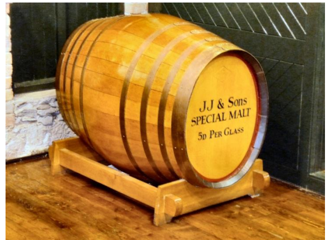
REPRESENTATION OF AN ORIGINAL BARREL

BRAY , the final stop for the day, a lovely seaside town outside of Dublin.