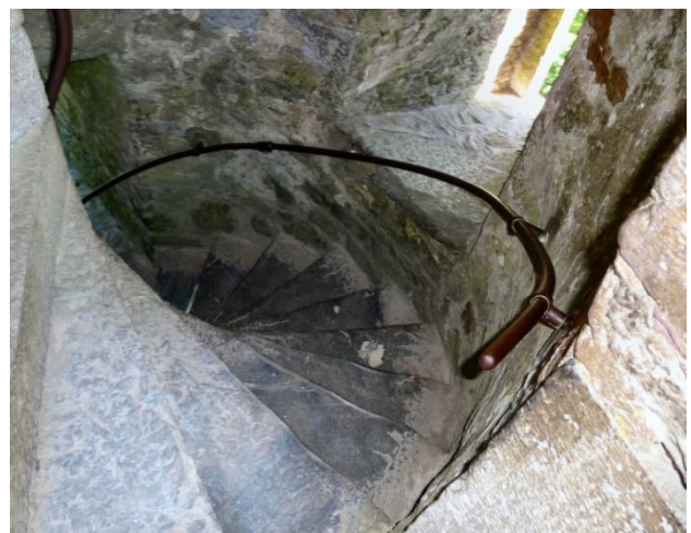
STAIRS, NOT MADE FOR MY BIG FEET!!