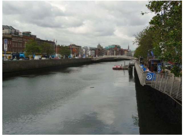
RIVER LIFFEY IN THE HEART OF DUBLIN CITY