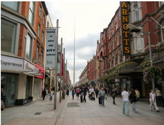
PAVED PEDESTRIAN/DELIVERY TRUCK ACCESS WORKS VERY WELL