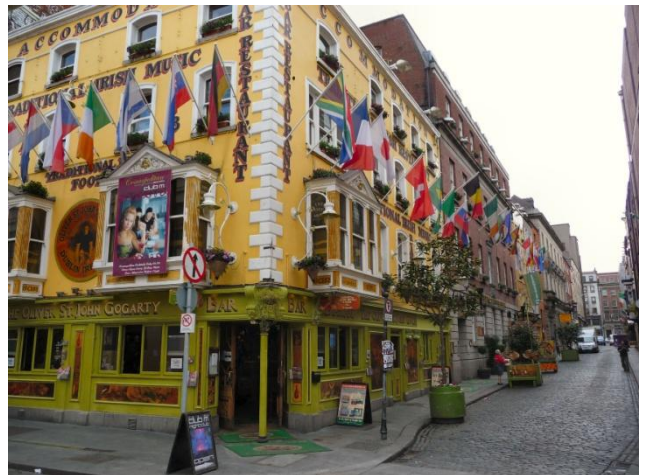
TYPICAL PUB WITH FLAGS EVERYWHERE