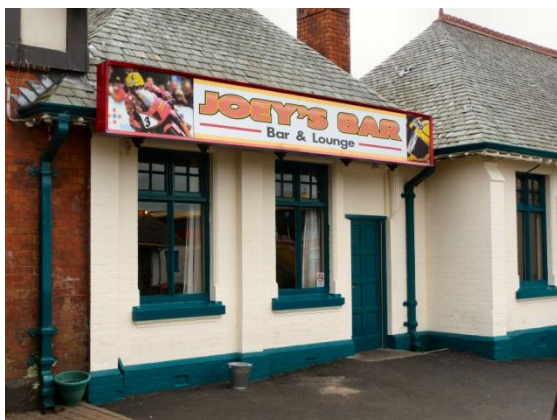
JOEY'S BAR WITH JOEY ON THE VTR1000 SP1, No.3!!